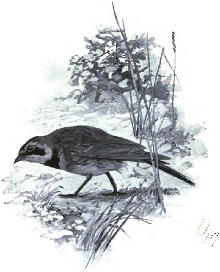
DESERT HORNED LARK